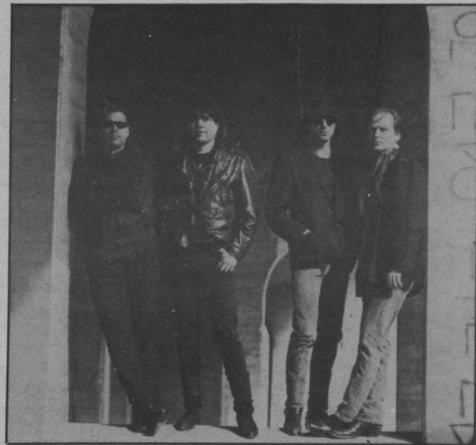
Walking Wounded - these folk-rock musicians will play live at the A.S. Party in Storke Plaza on Friday, Jan. 26, from 12-3pm.